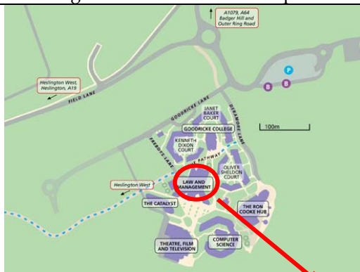
The York Management School

A number of companies operate buses to the University: the No. 44 departs from the railway station. The scheduled journey time from the railway station to Heslington East is 30 minutes. Other services are the C2, 27, 27a, 128 and 129.